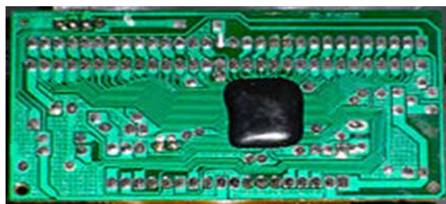
Figure 2: Printed circuit board with glob-top protected IC

The usage of conformal coatings for encapsulation of critical components, such as the integrated circuits, is critical and necessary for the functioning of these circuits. Apart from protecting from aggressive substances, the coating also shields the integrated circuit from light, an exposure that could disturb the functioning of the circuit. Figure 2 shows an example of such a coating that protects the integrated circuit (IC) on a printed circuit board.