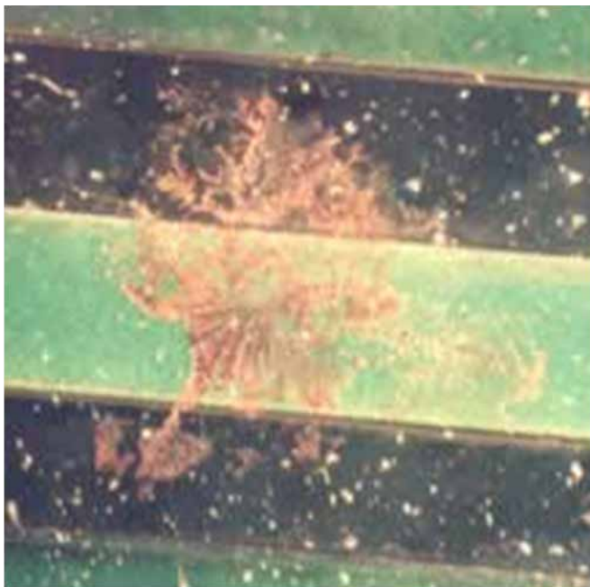
Figure 1: Condensation and conductive sediments can make up an electrolyte solution that under a DC voltage can lead to formation of a conductive path. Known as electro-migration, this process can lead to short-circuits or current leakage. The photo shows the migration of copper on a printed circuit board.

The presence of moisture in hearing instruments is particularly serious, as it interacts with other factors. For example, although hearing instruments most often will be operating in an environment near 37 degrees C (98 degrees F), ambient temperature variations still occur when the user removes their hearing instruments or enters an environment with an extreme temperature change. Combined with humid ambient air, such temperature variations can cause condensation inside the hearing instrument. This means that the electronic components, battery and contact points get wet, ultimately leading to corrosion and device failures.