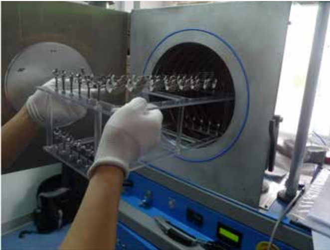
Figure 5: Hearing instruments mounted in fixture being loaded into the processing chamber.

Specialized manufacturing equipment is used to provide hearing instruments with the iSolate nanotech nanocoating. The central component of the manufacturing equipment is the processing chamber (Figure 5) which will hold a number of hearing instruments in a custom designed fixture for simultaneous processing. The processing chamber has an integral electrical coil that will subject small organic molecules (the monomer gas) to an ionizing electrical field under low pressure conditions thereby creating the plasma. The entire process is referred to as Plasma Deposition.