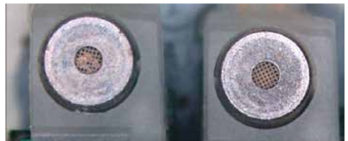
Figure 6 shows the difference in debris build-up on the microphone inlet screen for non-nanocoated (left) vs. nanocoated (right) devices that went through the AST test.

Checking the hearing instrument performance at regular intervals during the AST testing and inspecting for impact of the various exposure from the testing is an important part of quality assurance. As mentioned earlier, looking for signs of corrosion, migration, blockage of sound inlets (microphone ports) and build-up of debris, is a crucial part of the verification process.